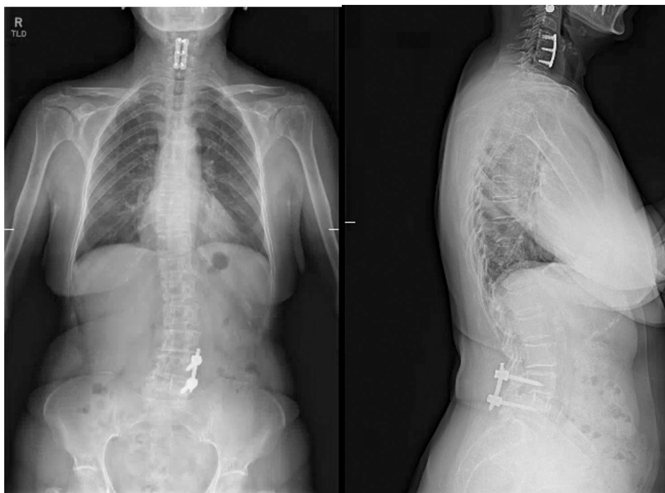
Fig. 1. Anteroposterior (left) and lateral (right) scoliosis radiographs demonstrating prior anterior interbody graft at L4/L5, anterolisthesis at L4/L5, and L convex scoliosis, apex L3 with Cobb's angle 16°.

Clinical evaluation revealed that the patient had L4–5 pseudarthrosis and adjacent segment disease associated with spinal stenosis and lumbar radiculopathy in the setting of lumbar degenerative disc disease. The patient described significant back pain and sought intervention to alleviate their pain and correct their degenerative pathology. The decision was made to proceed with surgical treatment with hopes of correcting all spinal pathologies.