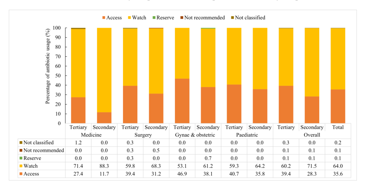
Figure 2. Antibiotics usage according to the WHO AWaRe classification at different departments of tertiary and secondary level hospitals in Bangladesh from February to April 2021.

62.9% (382), 36.4% (221), and 0.2% (1) of patients were treated with Watch, Access, and Reserve group of antibiotics, respectively, in surgery wards. Among the patients of gynae and obstetric wards, 55.4% (265), 44.4% (212), and 0.2% (1) patients were treated with Watch, Access, and Reserve antibiotics, respectively. Moreover, among pediatric patients, 60.7% (347) and 39.3% (225) of children received Watch and Access antibiotics, respectively. Use of Watch antibiotics was found more in secondary hospitals (71.5%) compared to tertiary hospitals (60.2%) ( p -value of 0.000). On the contrary, Access antibiotics were used more in tertiary hospitals (39.4%) compared to secondary hospitals (28.3%).