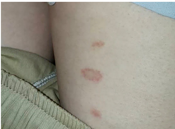
Fig. 3 Pityriasis rosea-like lesions on the thigh of a young woman. Most of her family members had COVID-19.