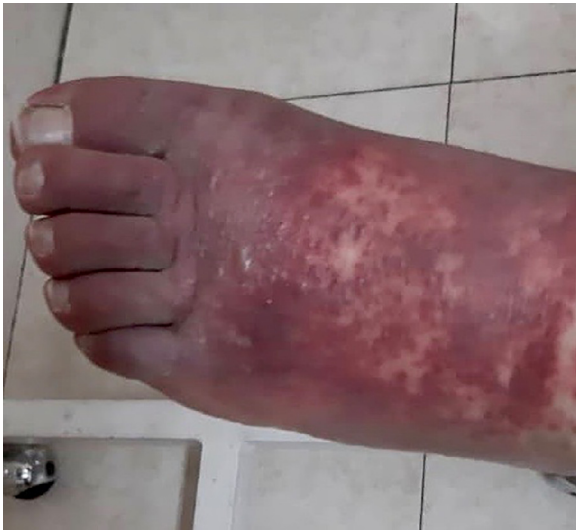
Fig. 4 Vasculopathic lesions of the limbs in a hospitalized man with COVID-19.