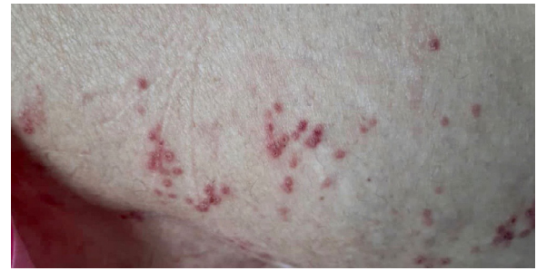
Fig. 5 Extensive vesicular herpetiform lesions of the buttocks in an older hospitalized woman with COVID-19.

aphthous-like lesions and vesicles. 80-82 Severe telogen effluvium was also a common problem for patients after recovery.