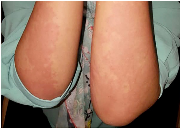
Fig. 2 Urticaria in a woman 1 week after recovery from mild COVID-19.