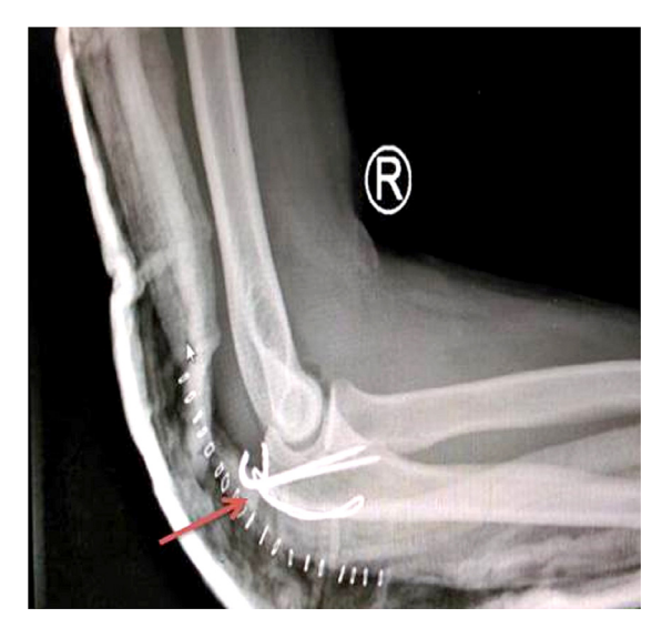
Fig. 5. Postoperative radiograph showing a Type III triceps tendon avulsion treated by a tension band fixation using K-wires and 18 gauge stainless steel wire.

The injury is common in males. The third to fifth decade is the commonest age group.<sup>12,13</sup> We found that the average age of our patient (31.5 years) was lower compared to the results (47.5 years) of a recent systematic review.<sup>5</sup> This difference is probably because we included only traumatic cases. There are reports of intraarticular arthroscopic examination in TTA injuries where there is an extension of fractures into the joint.<sup>2</sup> This variety is the one that we included in the Type IV classification. We have no Type IV injuries in the present series. Lack of proper clinical signs is an important factor in delayed diagnosis especially in partial injuries with preservation of active extension of the elbow. A palpable defect in the triceps tendon was found in 80% of patients in a previous study.<sup>5,6</sup> We have not included any patients with partial rupture. We