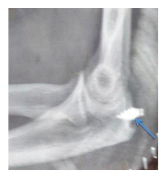
Fig. 4. Postoperative radiograph showing triceps avulsion injury repaired by suture anchor technique.

deep and superficial part. The mean distance of attachment of the triceps tendon from the tip of the olecranon is about 1.1 cm. The triceps injury with larger bony fragments extending into the articular surface cannot be differentiated from an olecranon fracture and hence have not been included in this study.