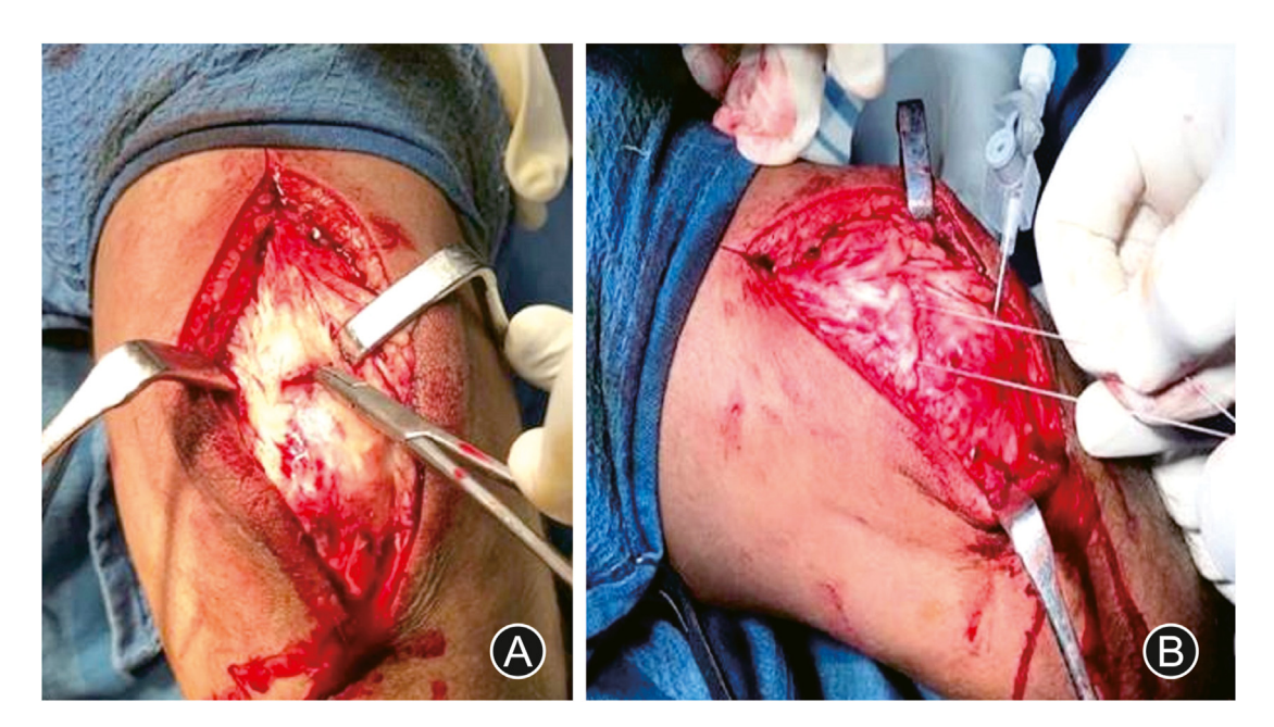
Fig. 3. (A) Intraoperative photograph showing Type I triceps tendon avulsion without bony injury; (B) Intraoperative photograph demonstrating transosseous tunnel repair.

We classify the TTA clinico-radiologically as Type I: palpable softtissues defect without bony mass and no bony fragment evident on the X-ray (an ultrasound scan or MRI scan is required for confirmation); Type II: Palpable soft-tissue defect with or without a palpable bony mass with a wafer-thin/comminuted bony fragment on the X-