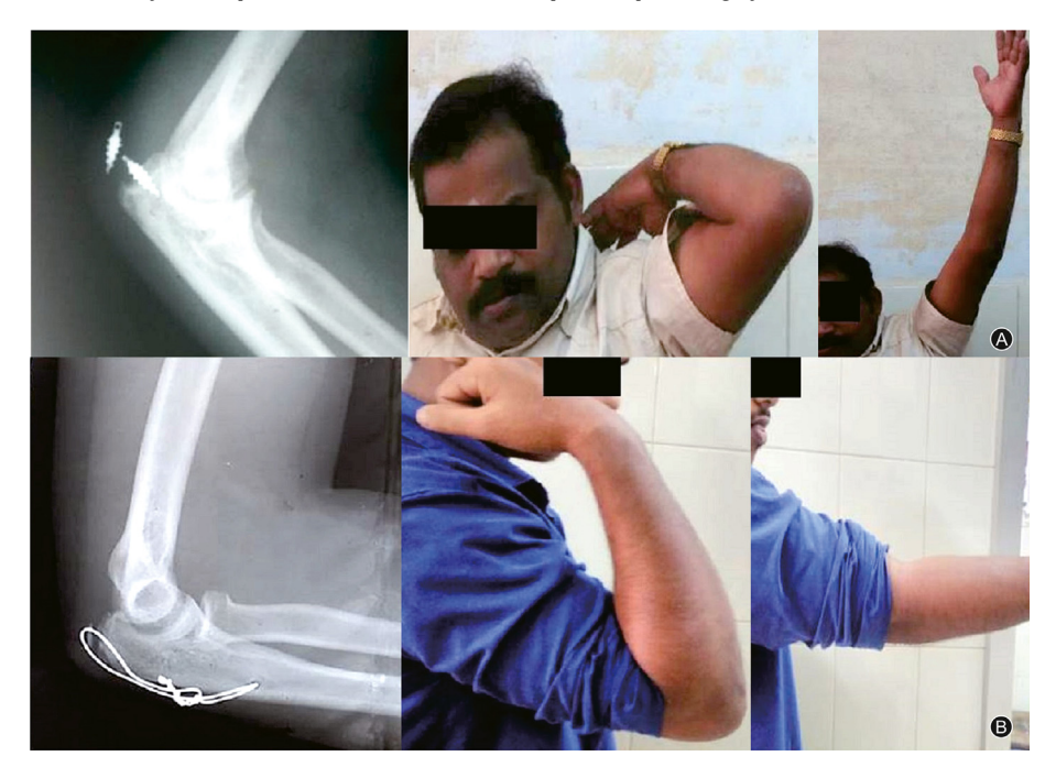
Fig. 6. Complications. (A) A patient treated using a suture anchor technique presented with a pull-out in the postoperative period. He had a full range of elbow movement (upper row). (B) (lower row) Radiograph showing K-wire removal following bursitis with follow-up showing the full range of movements of the elbow.

TBW: tension band wiring; MEP index: Mayo elbow performance index; HSS score: hospital for special surgery elbow score.