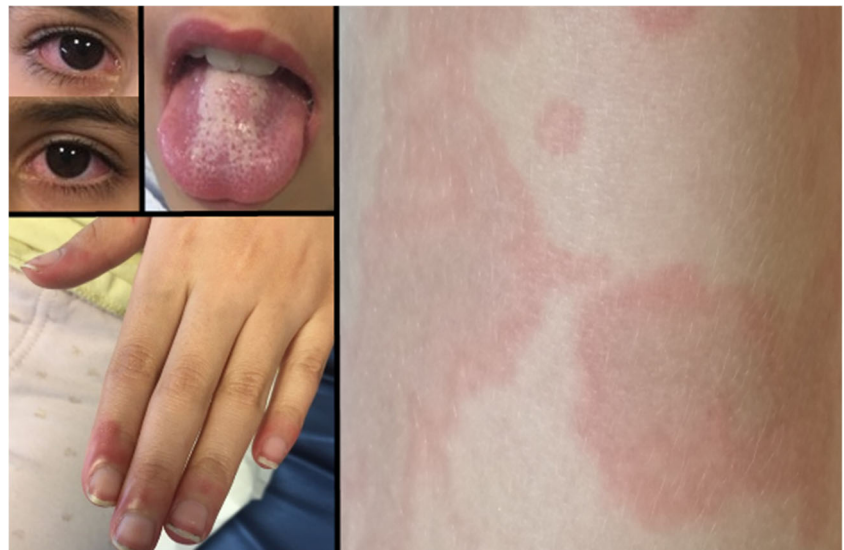
Fig. 2 Typical clinical feature of the COVID-19-linked myocarditis with Kawasaki clinical features

Two patients with myocarditis and one patient with Kawasaki syndrome died. One patient with myocarditis underwent emergency heart transplantation because of ventricular fibrillation storms 2 months after the initial episode. All the other