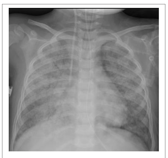
FIGURE 2 | Diffuse pulmonary hemorrhage in 3-year-old presenting with pulmonary-renal syndrome diagnosed as MPA.

Therefore, treatment recommendations are adapted from the adult clinical trials and expert consensus (42, 43). Survival rates in AAV has improved secondary to better disease management, the expertise of care teams at academic and referral vasculitis centers and treatment based on intensive remission induction followed by maintenance therapy. The Canadian Vasculitis research network (CanVasc) recommends that children with newly diagnosed AAV should be treated as per adult recommendations for induction of remission and then maintenance (43). Glucocorticoids and cyclophosphamide has been associated with dramatic improvement in patients with AAV, however this combination has not prevented relapses in the majority of patients and is associated with short and long term toxicity risk (44).