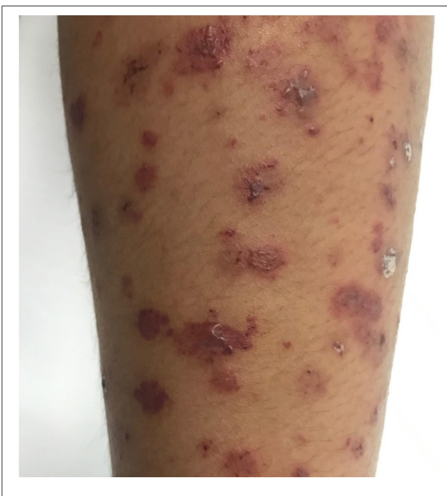
FIGURE 3 | Eight year old diagnosed with GPA with leucocytoclastic vasculitis involving upper and lower limbs.

setting of new or relapsing disease or for the treatment of severe diffuse alveolar hemorrhage (42). The largest trial investigating role of PLEX, the MEPEX trial (High-Dosage Methylprednisolone or Plasma Exchange as Adjunctive Therapy for Severe Renal Vasculitis) (59) showed an increased rate of renal recovery in AAV patients presenting with renal failure when compared with intravenous methylprednisolone. However, this trial enrolled patients who were dialysis dependent or nearing end stage renal disease and it was unable to identify role of PLEX as an adjunctive to conventional therapies. Long-term follow-up of the same cohort failed to identify sustained benefit in PLEX group (60). PEXIVAS is an international study which enrolled patients with AAV with severe renal vasculitis and/or diffuse alveolar hemorrhage. This study aims to determine if the adjunctive plasma exchange with two oral glucocorticoid regimens (standard- and reduced-dose GC) with standard remission induction immunosuppression is effective in reducing death and end-stage renal disease (61).