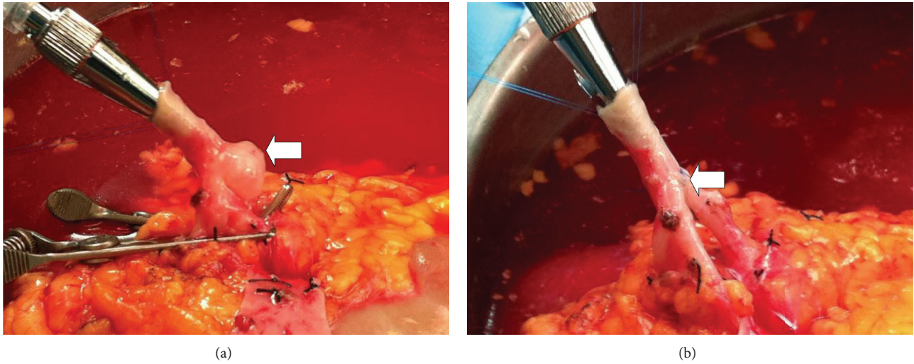
FIGURE 1: Saccular aneurysm of the donor renal artery before (a) and after (b) vascular reconstruction ( arrow ).