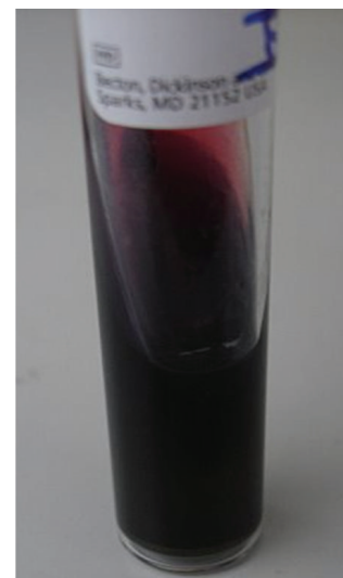
FIGURE 3: Triple sugar iron (TSI) slant. Hydrogen sulfide production is typically seen with Salmonella spp. and serves as a diagnostic aid.

Pyomyositis, an intramuscular abscess of skeletal muscle, is often described in three stages. The first (invasive) stage results in bacterial seeding into the muscle without abscess formation. The second (suppurative) stage is characterized by abscess formation. Ninety percent of cases are recognized at this stage. The third stage is characterized by septicemia, metastatic disease, and confers a high mortality [6]. Diagnosis must be confirmed by ultrasound, CT scan, or magnetic resonance scanning. Treatment of stage 1 includes antibiotics