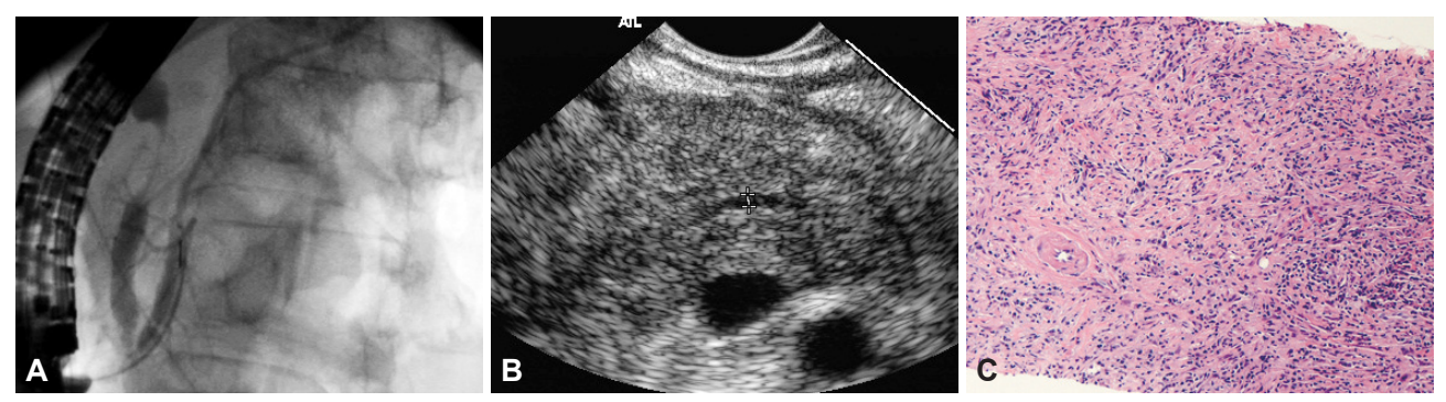
Fig. 2. Autoimmune pancreatitis type 1. (A) Endoscopic retrograde cholangiopancreatography shows a bile duct stricture and a long pancreatic duct stricture. (B) Endoscopic ultrasonography (EUS) of the pancreas body. (C) Histology of EUS-guided Trucut biopsy of the pancreas (H&E stain,×200).