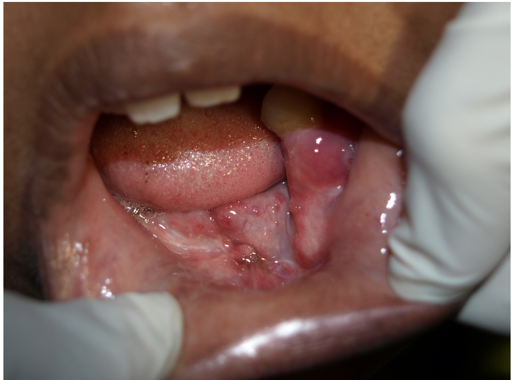
FIGURE 3: Intraoral missing tooth

Urine and blood routine investigations revealed normal results. Orthopantomogram reveals the presence of surgical plating in relation to the 36 and 37 periapical regions, and a 4 cm discontinuity in the lower cortical region of the mandible in the left premolar region. The patient has a resected mandible leaving a 1 cm cortical border in the right side of the mandible, and a thickening of the fractured edges in the right body of the mandible with an interposed 0.5 cm radiolucency between the fractured edges, as noted in Figure 4.