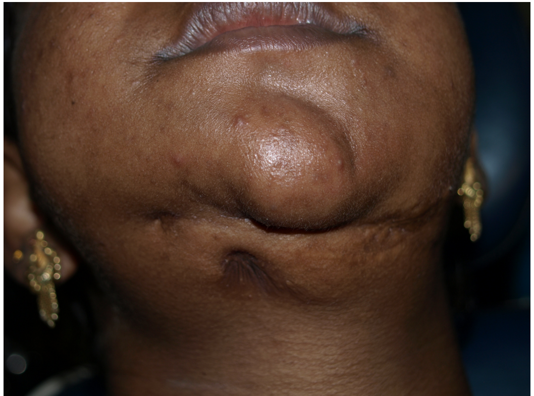
FIGURE 2: Scar in the lower border of mandible

One right submandibular lymph node is palpable, tender, firm in consistency, freely mobile, and measuring around 1.5 cm × 1.5 cm in size. The patient's ability to open her mouth is restricted, with an interincisal distance of 35 mm. Limited jaw movements were noted. Teeth missing were 15, 16, 27, 31, 32, 33, 34, 35, 41, 42, 43, 44, 45, 46, and 47 (Figure 3).