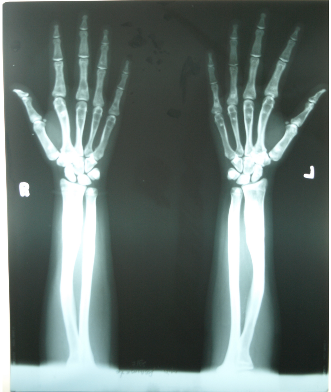
FIGURE 5: Radiograph of hands showing increased radio-opacity