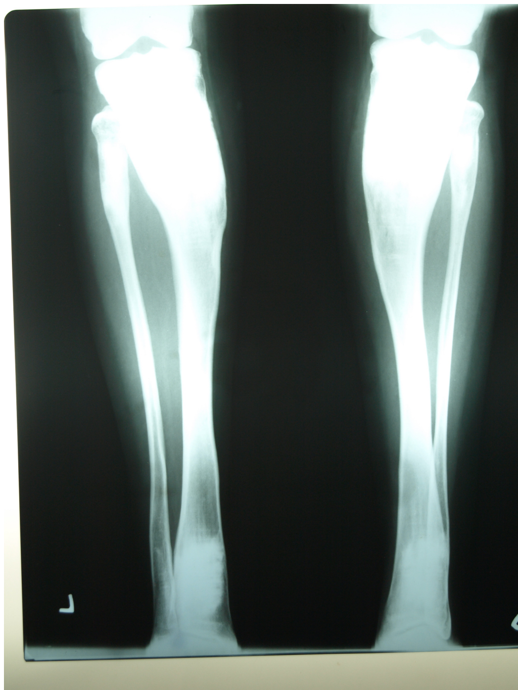
FIGURE 6: Radiograph of legs showing increased radio opacity

Figure 7, a radiograph of the pelvic bone, also reveals an increased radio-opacity of the bone, with a healing fracture site in the left femur, which also denotes the site of malunion due to improper positioning of the fracture edges.