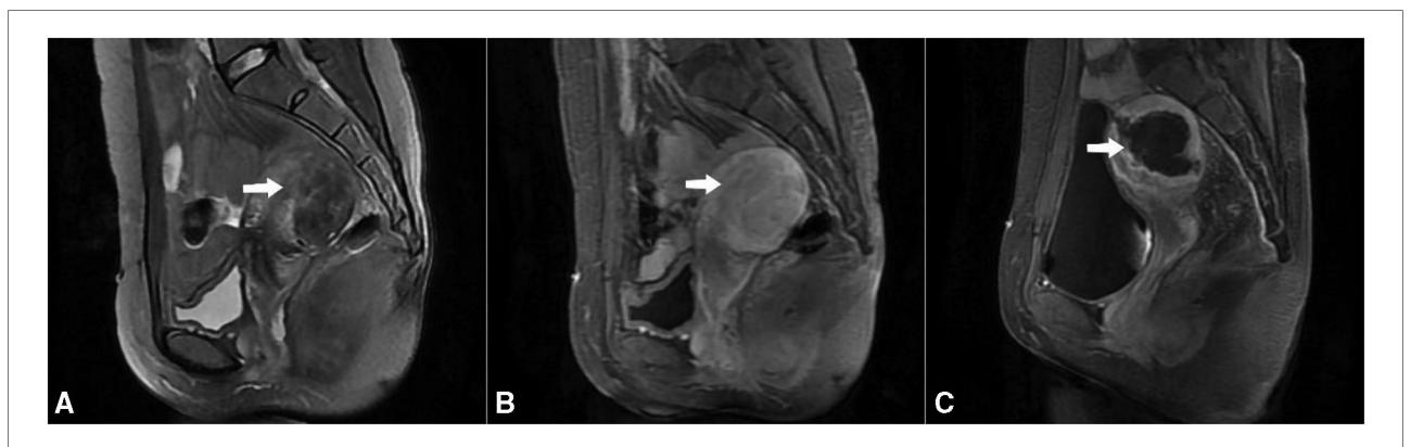
FIGURE 1 Mr images obtained from a patient with adenomyosis. (A) T2WI shows a well-defined adenomyosis lesion, which is a poorly defined low-signal lesion with scattered punctate and patchy high-signal foci located in the posterior uterine wall (arrow); (B) Contrast-enhanced MRI showed perfusion of the adenomyotic lesion (arrow); (C) Post-treatment T1-weighted contrast-enhanced image shows that the non-perfused volume ratio was 83.5% (arrow).

to compare differences between groups and P < 0.05 was considered statistically significant. In addition, multivariate logistic regression analysis was used to determine the influencing factors of patients' choice of HIFU.