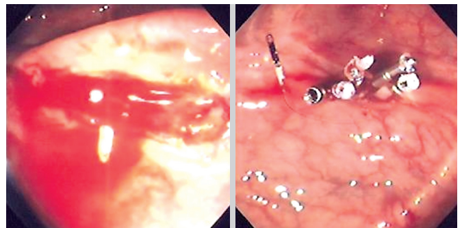
Fig. 1. Hemoclips applied at the delayed postpolypectomy bleeding site.

Morphologically, pedunculated polyps were involved in 1 case