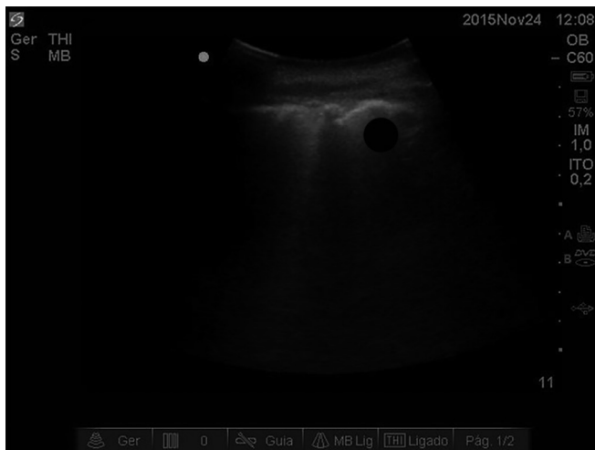
Figure 3 - Ultrasound images of the patient's lung, revealing B lines.

performed on that day revealed atelectasis at the base of the right lung. After bronchial hygiene maneuvers, the clinical status was restored, and the previous parameters were achieved with improvement in the Cst and Rva values (days 8 and 9 of MV). However, on the 9 th day of MV, new worsening was observed in the PaO 2 /FiO 2 , with the need for high FiO 2 . Ultrasound of the lung showed B-lines (Figure 3), but a CT scan of the chest revealed no significant atelectasis areas. When the PEEP was adjusted to 12cmH 2 O and the water balance was made negative, an increment in the oxygenation index to 175 was observed within 24 hours.