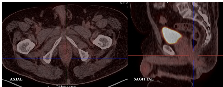
FIGURE 3: Axial and sagittal view of post-chemoradiotherapy PET-CT.

PET-CT: positron emission tomography-computed tomography