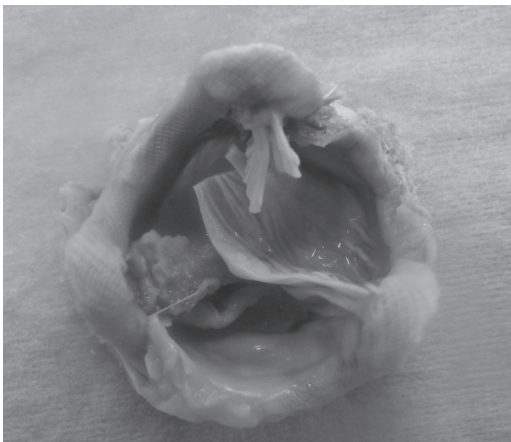
Fig. 2 The extracted Mosaic valve in the mitral position. The tear in the leaflet was detected.

data showed pulmonary artery pressure (PAP), central venous pressure (CVP) and cardiac index (CI) values of 47/22 mmHg, 7 mmHg, and 2.1 L/min/m 2 , respectively, when the arterial pressure (AP) showed 70/29 mmHg, with the use of 0.02γ of noradrenaline, 0.015γ of epinephrine, 3γ of dopamine, and 6γ of dobutamine. The cardiologist performed transesophageal echocardiography (TEE). No MR was detected, and the status of LVOT could not be evaluated because of bioprosthesis artifact in