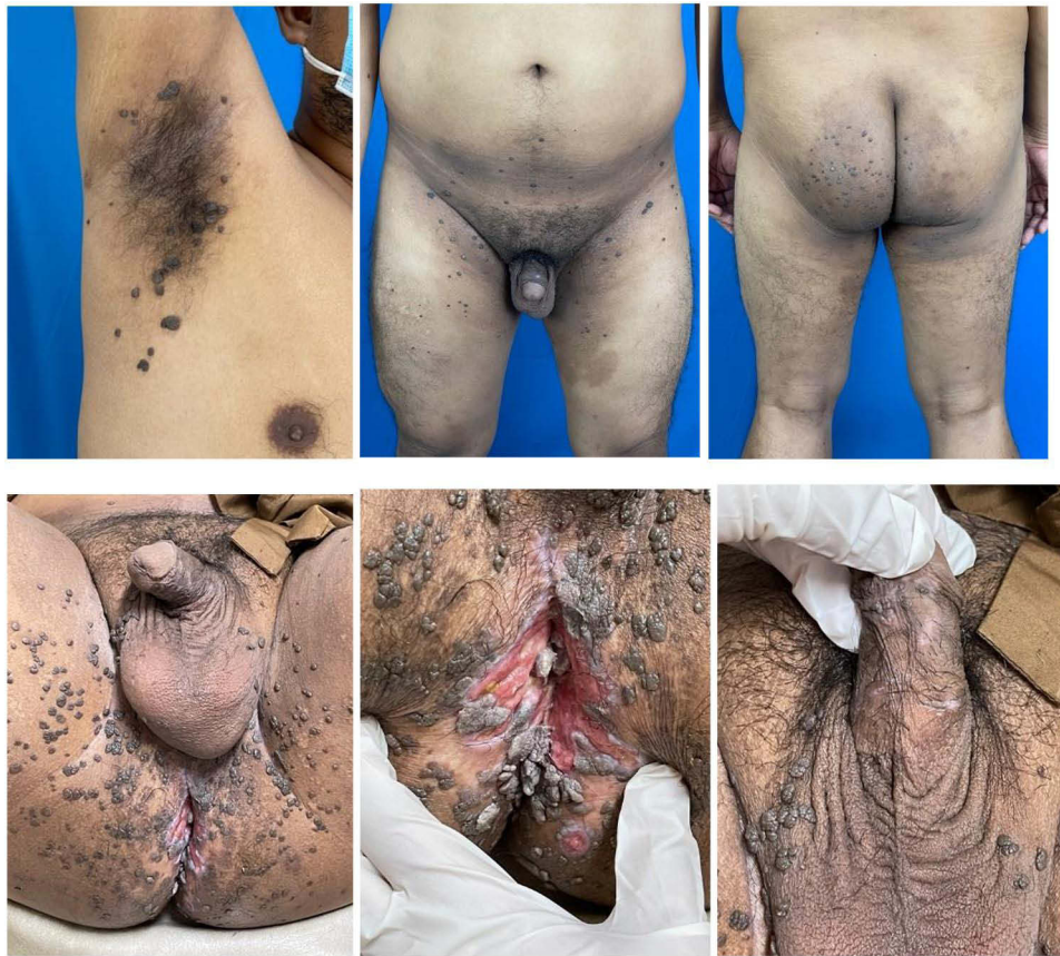
Figure 3 Progress of patient's clinical figure after 4 cycles of TCA.

patients could have compromised host recognition and HPV clearance, leading to concurrent infection perpetuation and viral immune evasion tactics. 19