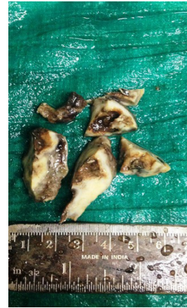
Figure 2. Gross appearance of the ovarian mass received in multiple bits. The mass is partly solid and partly cystic. The yellow discoloration of the tissue is evident.

500 mL of cloudy foul smelling material was drained. The excised mass was sent for histopathological examination and was received in the Department of Pathology of the institution as multiple soft tissue pieces that together measured 7 x 4 x 3 cm. The cut surface was partly solid and partly cystic with yellowish tinge (Figure 2).