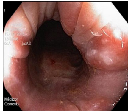
Fig. 2. Tubular rectum – hardened and erythematous mucosa with pale nodular lesions.