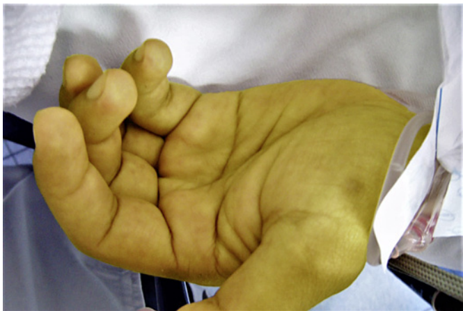
Fig. 1. Maculopapular rash on the palms.