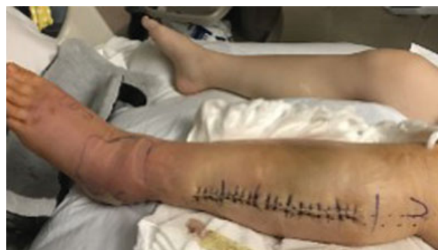
Fig. 2 Status after left distal lower extremity anterior and lateral compartment fasciotomy.