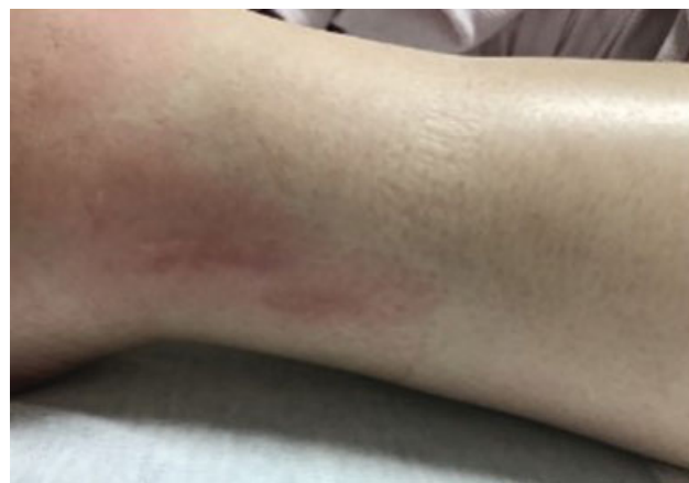
Fig. 1 Solitary physical exam finding of focal left ankle erythema in the setting of severe distal left lower extremity pain.