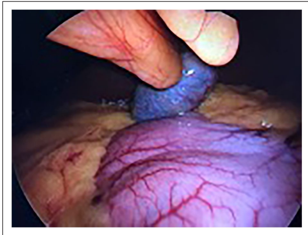
Image 1. Intra-operative picture on laparoscopy—gall bladder is seen on the left side of the falciform ligament.