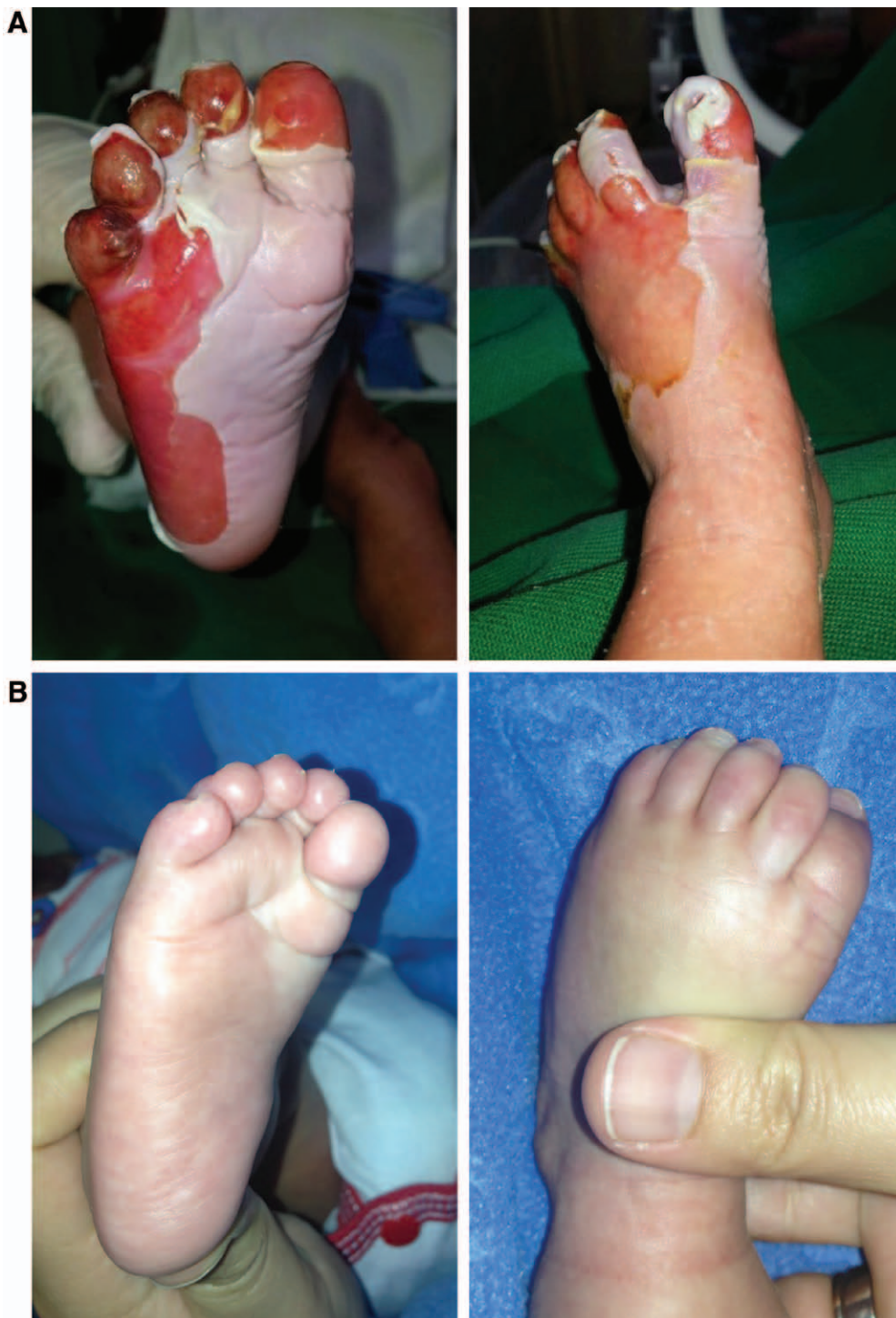
Fig. 2. A, Seven-day-old patient with deep second-grade scalding burns in feet. Surgical debridement and keratinocyte sheet placement. B, One-year follow-up with adequate scar and with no evidence of functional limitation.

characteristics must be guaranteed, as they are more susceptible than adults to any injury due to the immaturity of all body systems. It is for this reason that the dermal substitutes become a favorable and effective option for covering denuded areas that may