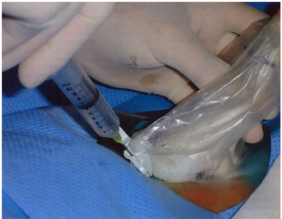
Figure 1. Administration of local anesthesia for ultrasound-guided biopsy of the right internal jugular vein

the initial quality (in terms of damage), were checked, and if the sample size was not adequate or the sample was fragmented, another biopsy was performed around the site of the previous biopsy, following the same procedure. In this study, after each sampling, the sample was maintained in saline and immediately given to a pathologist. Then, the harvested area was controlled via fluoroscopy and contrast injection and possible complications were reviewed. After sampling, the perforated skin regions were compressed for one minute to prevent bleeding and hematoma in the neck, which might put pressure on the airway. Abdominal ultrasound was performed to check the presence of free fluid or hematoma in the liver and peritoneal cavity. The obtained results were recorded, and nurses monitored and recorded the vital signs for 24 hours. Moreover, other symptoms such as abdominal pain, nausea, vomiting, and shortness of breath, chest pain, and neck pain were evaluated and recorded. Twenty-four hours after the biopsy, patients were visited by a gastroenterologist and abdominal sonography was performed again for evaluating the probability of any complications. Finally, the histological report was prepared by the pathologist, which included the sample size, rate of sample injury, and the count of complete portal tract (CPT); then, the final diagnosis was made.