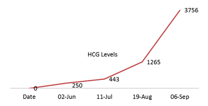
Figure 1 Graph: Increasing HCG level.

(hCG) which is secreted in excessive amounts and usually serves as a key marker for diagnosis as in our patient (Fig. 1). It is also utilized as a prognostic marker and to monitor response to treatment. The origin of the tumor is uncertain. One explanation is the testicular origin with metastasis to the mediastinum and subsequent involution and regression of primary testicular tumor before the diagnosis (4, 5). It is, however, challenged by the fact that testicular tumors usually metastasize to retroperitoneal nodes initially, bypassing mediastinum. Another widely accepted explanation is entrapment of germ cells arising from the mesothelium of primitive gonads or yolk sac endoderm along the urogenital ridge which remains dormant and only manifests in malignant form by stimulation after puberty (6, 7). Detailed and extensive search for primary origin should be conducted with the main focus on gonads before making a diagnosis of primary mediastinal choriocarcinoma. The classic triad of chest pain, cough and fever is described