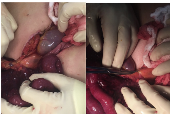
Fig. 1. (A) Tethered discolored small bowel segment, (B) Single, free intraperitoneal staple caught on small bowel mesentery.