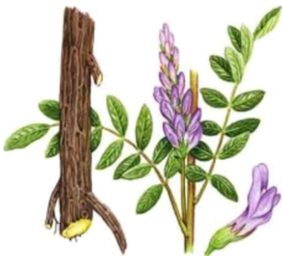
Fig. 1 – Photograph of Glycyrrhiza glabra herb.

Licorice herb ( Glycyrrhiza glabra - G. glabra ) has routinely been used for centuries in traditional Chinese. 11 Roots and rhizomes of this herb has been reported to be antioxidant, antimicrobial, and antiviral. 12,13 Furthermore, G. glabra has anti-inflammatory, anticancer, and anti-ulcer activity. 14-16 Licorice is extracted from the root of G. glabra herb and one of its active ingredient is glycyrrhizin acid, which due to its affinity to mineralocorticoid receptors may result in edema and hypertension. Therefore, it should be used with caution in patients suffering from cardiovascular disease and/or hypertension. 17 (Fig. 1).