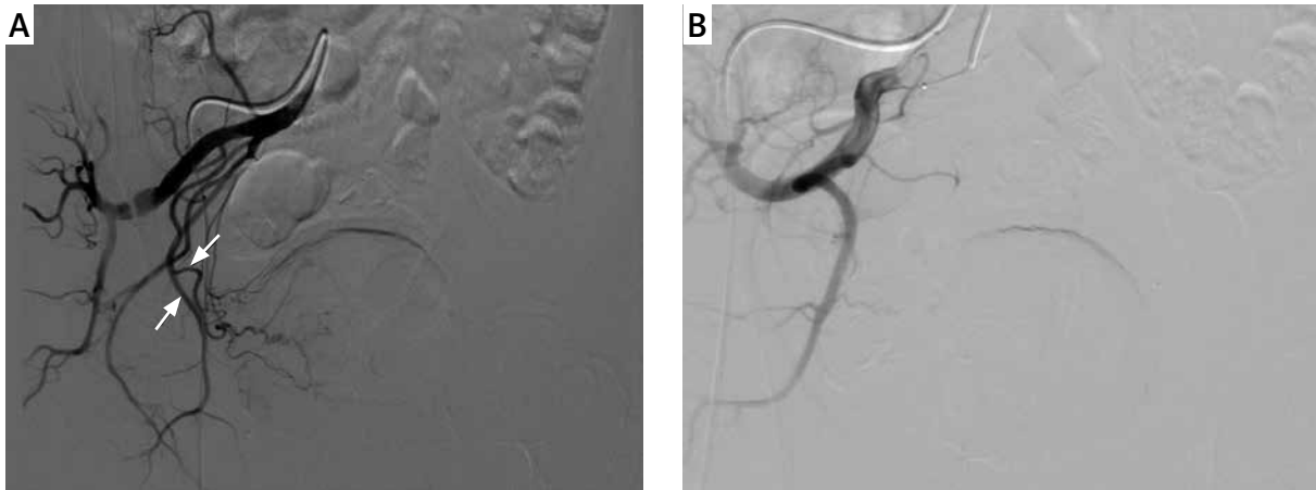
Photo 1. Right pelvic angiography of a 72-year-old male patient suffering from LUTS secondary to BPH. A – The right prostate artery (down arrow) and internal pudendal artery (up arrow) before PAE. B – After PAE, the right prostate artery and internal pudendal artery are not seen

oscopic guidance until the control angiogram revealed blood flow only in the proximal part of the prostatic artery, avoiding reflux of the embolic agent to undesired arteries. Follow-up angiography was conducted manually to check whether the distal arterial vasculature was dramatically depleted. Embolization was then performed on the contralateral side, using the same technique. Finally, all the catheters and sheaths were subsequently removed (Photo 1 B).