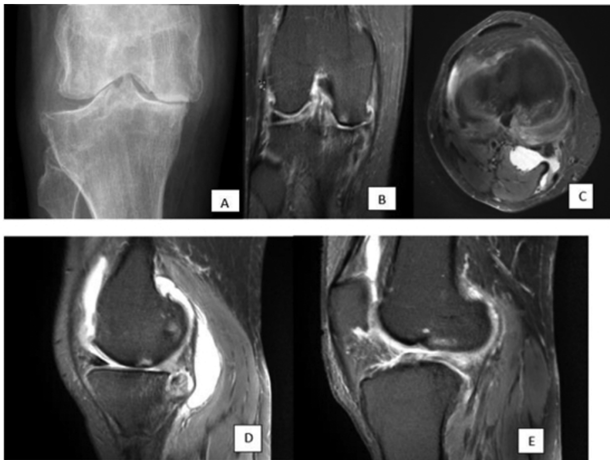
Fig. 3 (Representative case). A 39-year-old woman presented with bilateral knee pain for the past 2 to 3 years. Her Western Ontario and McMaster scoring system (WOMAC) total pain score was 12/20. (A) Posteroanterior (PA) X-ray shows severe reduction of medial joint space with large osteophytes, subchondral sclerosis, and subchondral cysts suggesting Kellgren–Lawrence grading system (K-L) grade 4. (B) Coronal proton density fat-saturated (PDFS) image shows full-thickness cartilage loss in the medial femoral and tibial articular surface with large osteophytes and severe narrowing of the joint space. (C) Axial PDFS image shows Baker's cyst between the tendons of semimembranosus and medial head of the gastrocnemius. (D) Sagittal PDFS image shows complete maceration of the posterior horn of the medial meniscus. (E) Sagittal PDFS image reveals complete anterior cruciate ligament (ACL) tear.

also observed that the prevalence of OA increases with increased age. 6–9