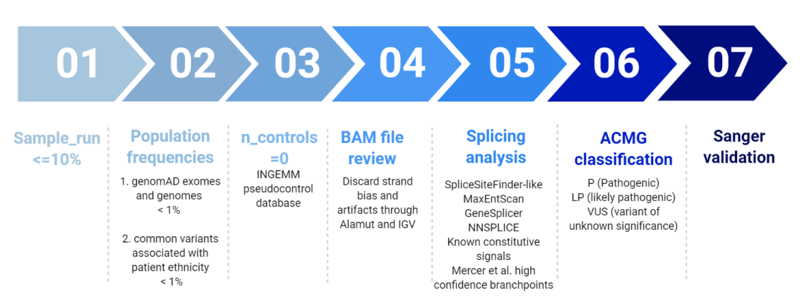
Figure 1. Filtering pipeline for NGS panel HAP v1.2. Modified from Tenorio et al. 2020 [25].

Variant prioritization was performed according to a custom filtering algorithm considering quality of the base pair reads, variant allele frequency in pseudo control populations and pathogenicity predictors as previously described [25], and summarized in Figure 1. Finally, variants were classified according to the guidelines described by the American College of Medical Genetics and Genomics (ACMG) [26].