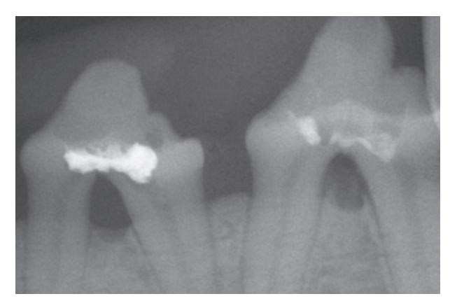
Figure 3- Periapical radiograph of the left mandibular second and third premolars sealed with gutta-percha and AH Plus, respectively, showing presence of periodontal lesion in the perforation region