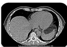
Repeat PET and CT status demonstrating response to Herceptin therapy.