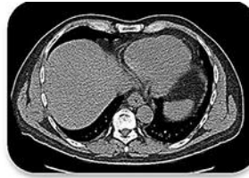
Initial PET and CT demonstrating gastroesophageal mass.