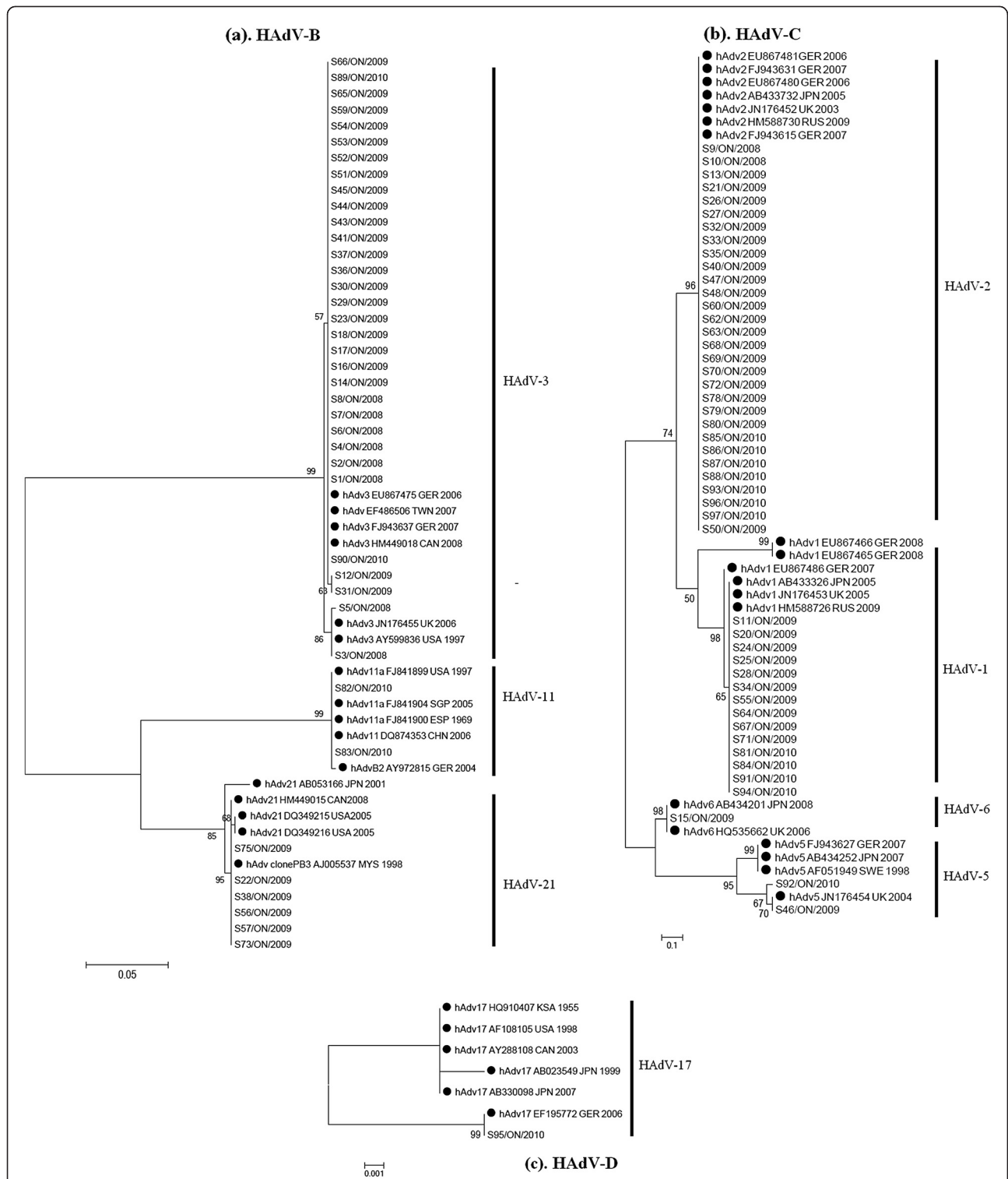
Figure 3 Phylogenetic trees of Greater Toronto Area human adenovirus species B, C and D hexon gene, hypervariable region 7 (HVR 7), nucleotide sequences. (a) HAdV B species and corresponding serotypes (3, 11, 21), (b) HAdV C species and corresponding serotypes (1, 2, 5, 6), and (c) HAdV D species and corresponding serotype (17). Reference sequences representing known serotypes are indicated by a solid circle. Multiple sequences alignments and phylogenetic trees were constructed using ClustalW and the maximum likelihood method algorithm within MEGA 5.05 software, respectively. Tree topology was supported by bootstrap analysis with 1000 pseudo replicate datasets. The scale bar represents the number of nucleotide substitutions per site between close relatives.