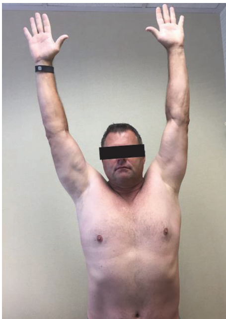
FIGURE 2: Photograph showing the patient's left shoulder motion at 18-month follow-up (active forward flexion is 165°). Preoperative photographs were not available, but active forward flexion was only 65°.

After wound closure, the patient was placed in a rigid shoulder orthosis in neutral rotation and 45° abduction for two months, following Gerber et al.'s [9] postoperative treatment. Gentle passive shoulder motion was allowed only after 6 weeks. Active overhead motion was not allowed until four months after surgery. Weight bearing exercise at the shoulder was allowed at nine months after surgery but no lifting over 20 lbs (9 kg) overhead until one year after surgery.