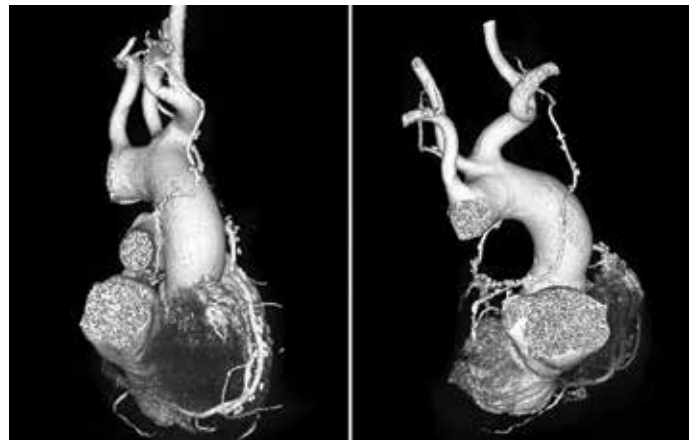
Figure 3. RITA passage through the transverse sinus to reach a marginal obtuse artery

In 2001, Taggard et al. (13) performed a meta-analysis on 15,962 patients and identified a 10-year patency rate of 90%–95% for ITAs while 75% of SVGs presented stenotic or occlusive lesions. Benedetto et al. (14) analyzed nine randomized trials including 1620 angiographic controls at 1–7.7 years after CABG and quantified four times higher occlusion risk for the SVG than that for the RITA and three times for the RA. For patients >70 years old, Habib et al. (15) proved on a study group of 2120 cases an increased survival rate of 5 and 10 years for the ITA–RA association (85.1% and 70.9%, respectively) compared with the ITA–SVG association (70.6% and 50.5%, respectively). In our case, the highest patency rate was obtained with LITAs (90.16%), followed