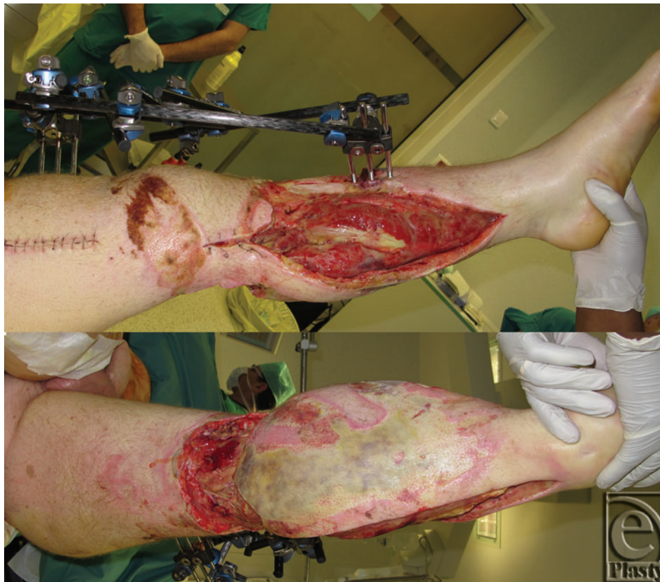
Figure 1. Cutaneous defect and aponeurotomies with bone, bypass, and knee joint exposition. Medial and posterior views.

On the 10th day, an omentum free flap was harvested with median laparotomy to treat the patient for exposure of the knee joint, upper part of the tibia, and vascular bypass at the surgical approach to the leg (Fig 1).