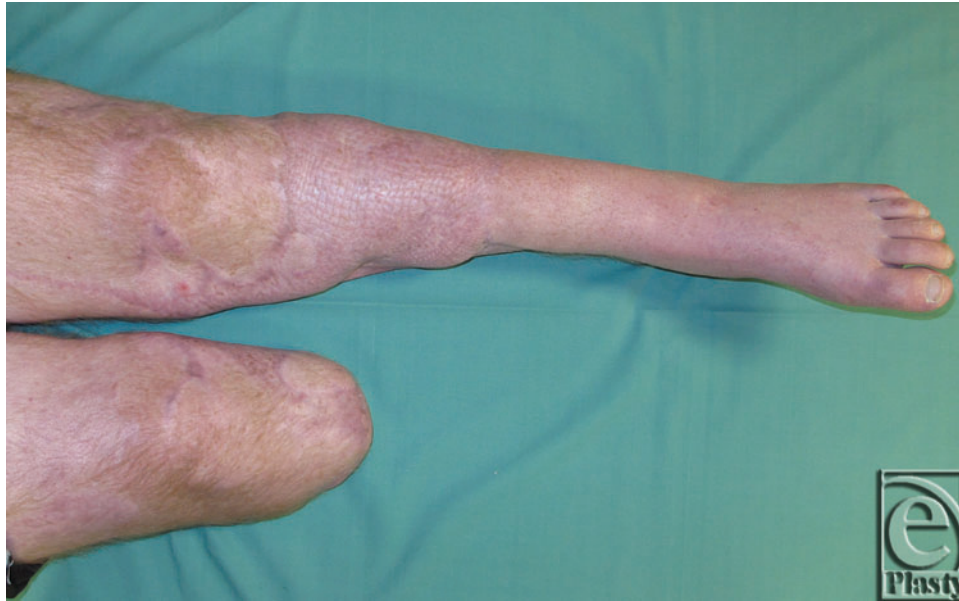
Figure 4. Clinical aspect after 1 year of follow-up.