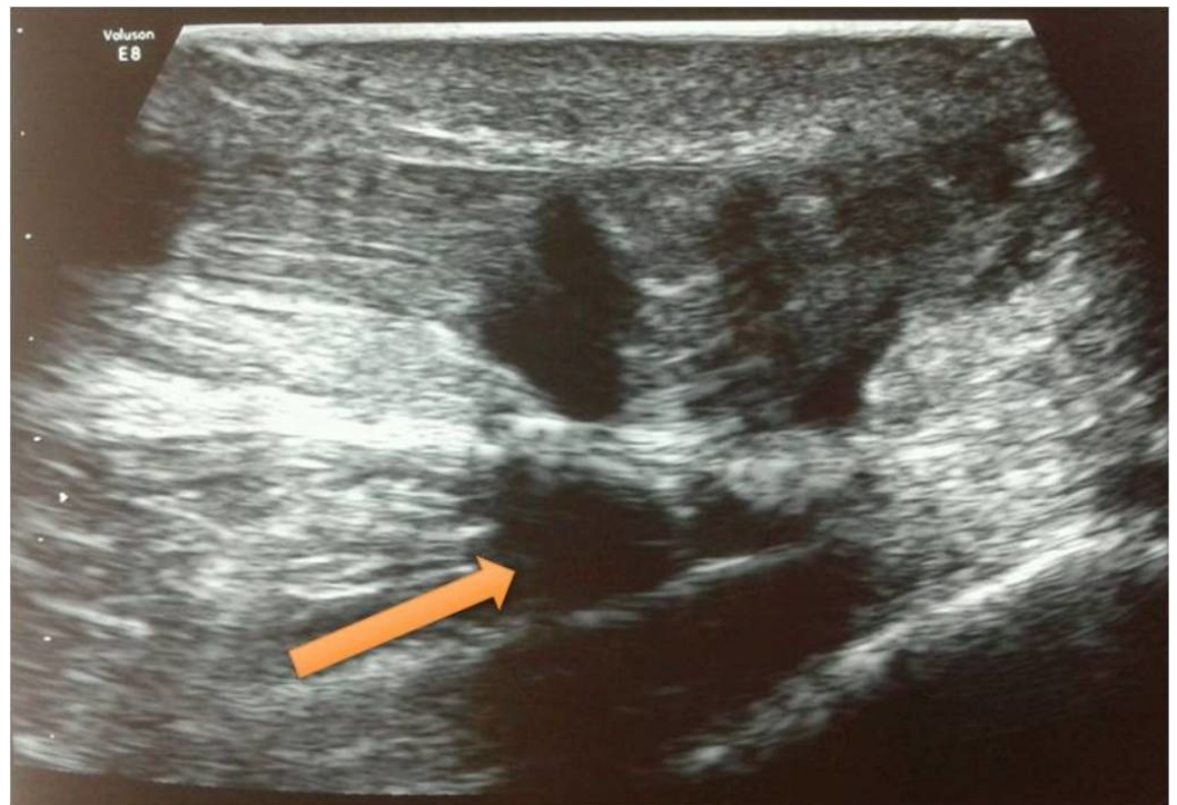
FIGURE 1: Ultrasonography of right Achilles tendon showing complete rupture

Real-time ultrasonography of both the ankles was done which showed a complete tear of the Achilles tendon on the right side (Figure 1) and a partial tear on the left side (Figure 2).