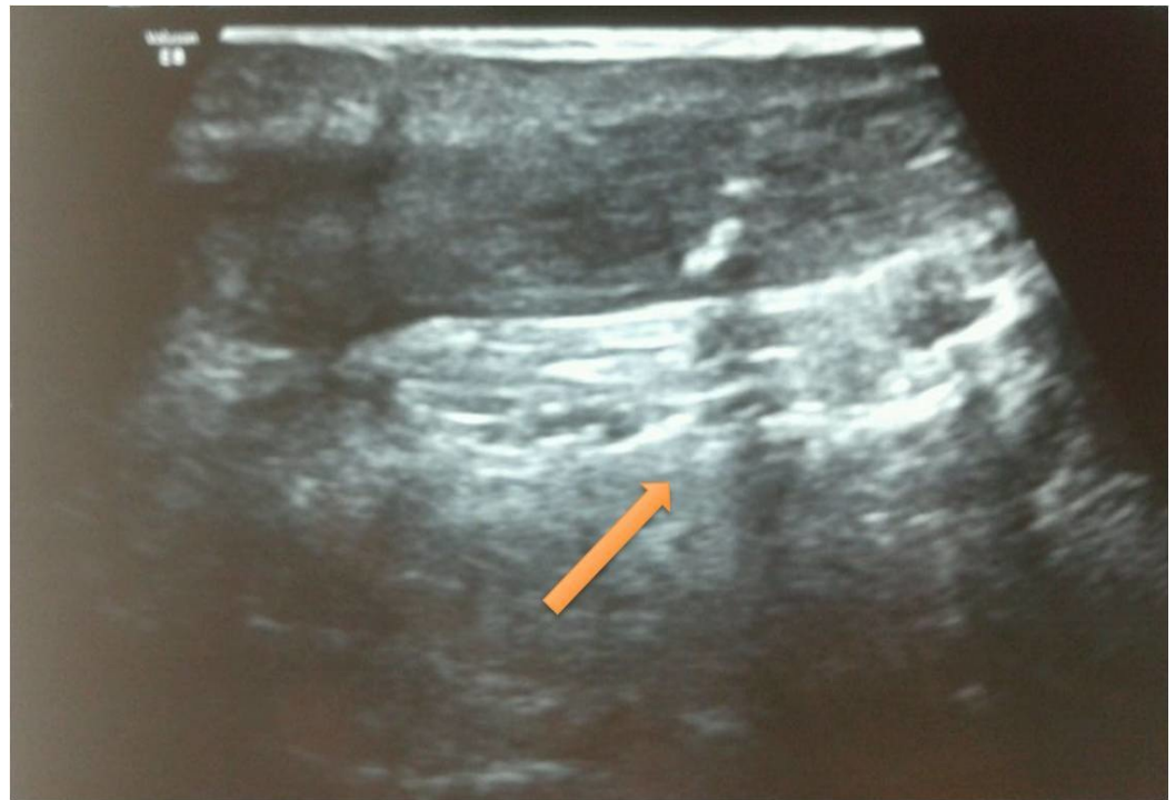
FIGURE 2: Ultrasonography of left Achilles tendon showing partial rupture

The tear on the left side was treated conservatively by an above-knee plaster cast with the ankle in plantar flexion for one month. On the right side, an end-to-end repair was done with Ethibond sutures with anchorage in calcaneum and an above-knee plaster cast was applied in plantar flexion for one month.