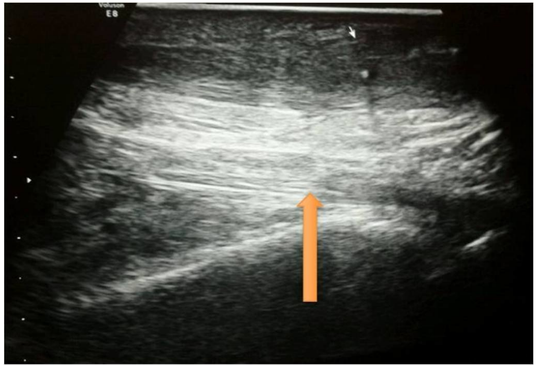
FIGURE 3: Ultrasonography of right Achilles tendon at nine months follow-up showing complete healing of the tendon.