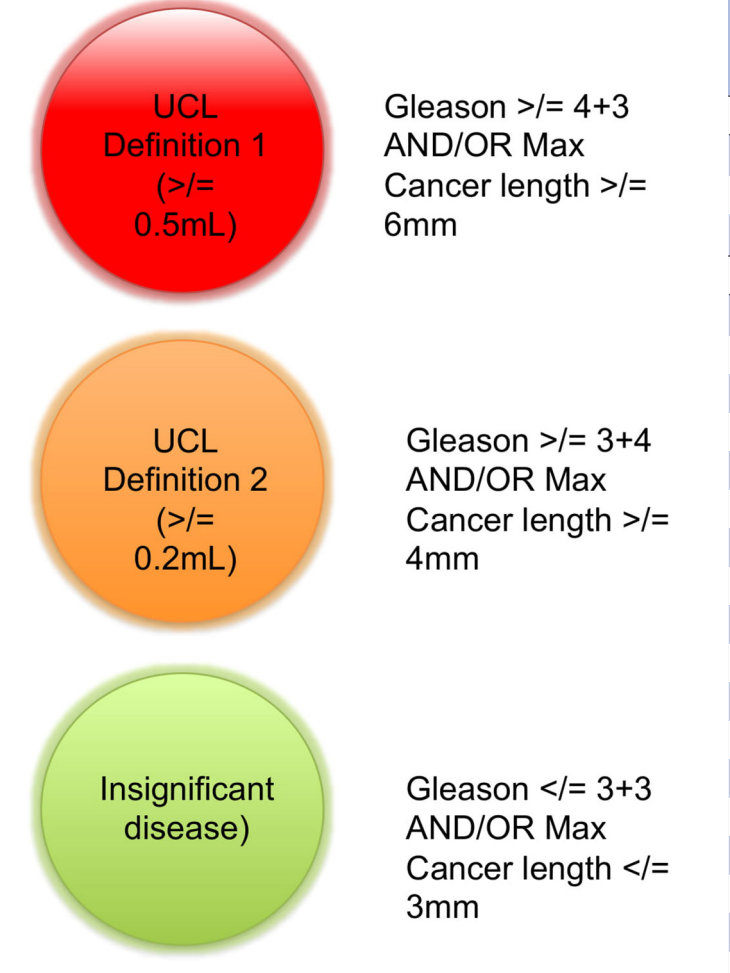
Figure 3 The University College London (UCL) 'traffic light like' system to define significant prostate cancer.