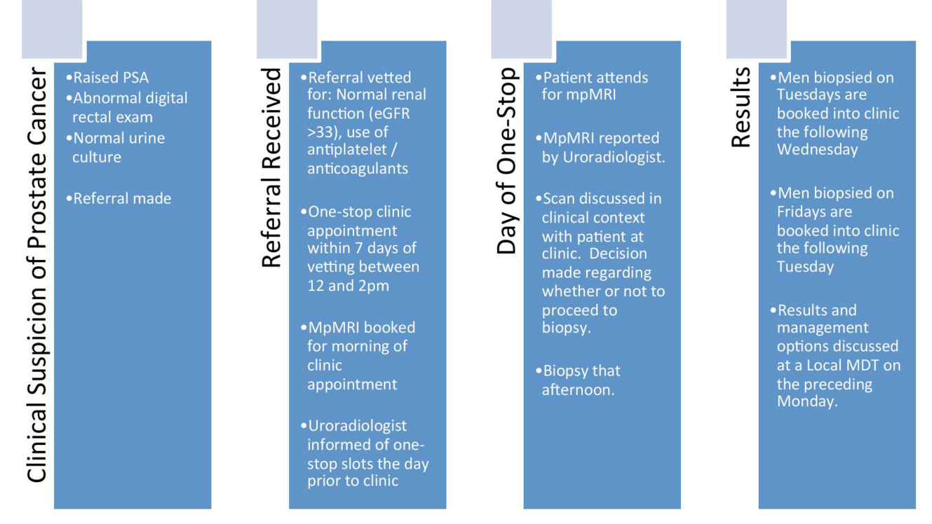
Figure 1 The One-Stop mpMRI-led MRTB prostate cancer diagnostic pathway. MDT, multidisciplinary team; mpMRI, multiparametric MRI; PSA, prostate-specific antigen.