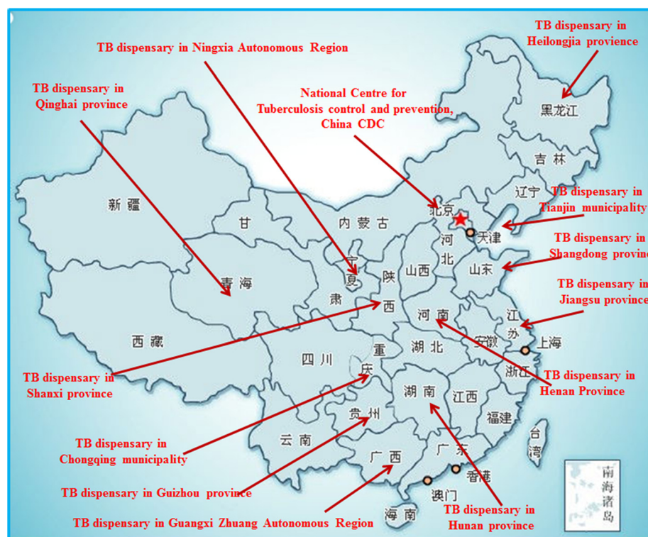
Figure 2 Experts in Delphi expert panel. This figure presents the geographic distribution of experts who participated in the Delphi expert panel. The sixteen experts were from thirteen provinces/regions representing North, South, East, and West, China.

Figure 1 shows the flow of the Delphi process (Step 4-7). In the first round, participants were asked to rank the importance and feasibility of the indicators to evaluate