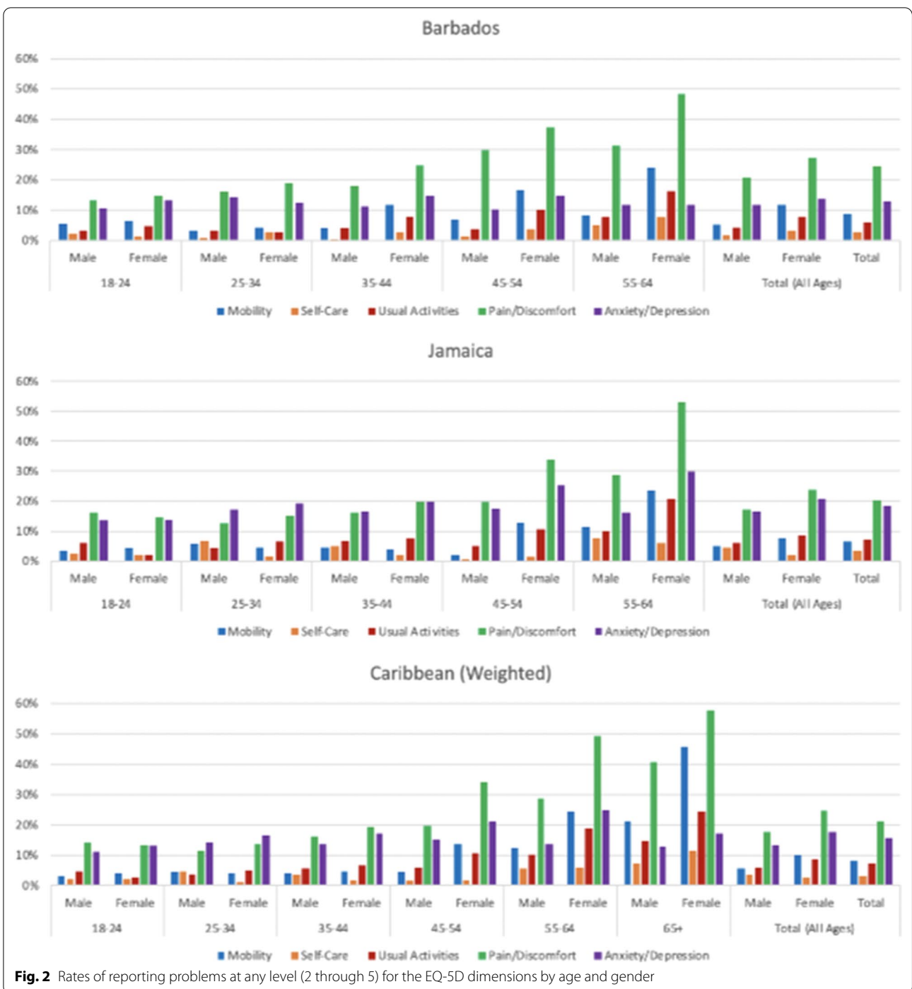
Fig. 2 Rates of reporting problems at any level (2 through 5) for the EQ-5D dimensions by age and gender

age-gender groups for the two countries were generally similar with pain/discomfort and anxiety/depression being the dimensions to have the highest frequency of reported problems, and with frequency increasing with age. Males in Barbados reported problems with pain/discomfort more frequently than males in Jamaica in