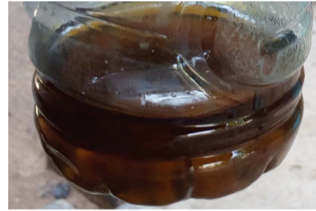
FIGURE 2: Coca-Cola colored urine.

Clinically, the syndrome is well characterized [4]. Presentation is typically acute hepatonephritis occurring 24 to 48 hours after the administration of antimalarial drugs. Anaemia is severe from the start and intravascular hemolysis, occurring in a context of severe malaria, leading to oliguria, dark urine, abdominal pain, jaundice, hepatic splenomegaly, vomiting, and renal failure [4]. Renal involvement is thought to be secondary to acute tubular necrosis [4]. The port wine coloration of urine is the most consistent sign; Bodi et al. [17] in the Democratic Republic of the Congo (DRC) found this aspect in all patients. Other symptoms may be observed such as disturbances of consciousness, dyspnea, tachycardia, general malaise, and vertigo. Rapid onset and deterioration were described with immediate collapse, coma, and anuria [11]. Our patient died under these conditions. The time to onset of symptoms may be longer; in 2015, Thiongane et al. [3]