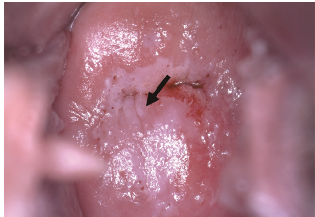
Fig. 2. Ridge sign. The arrow points to the opaque protuberance of an acetowhite lesion after application of 5% acetic acid within the transformation zone.