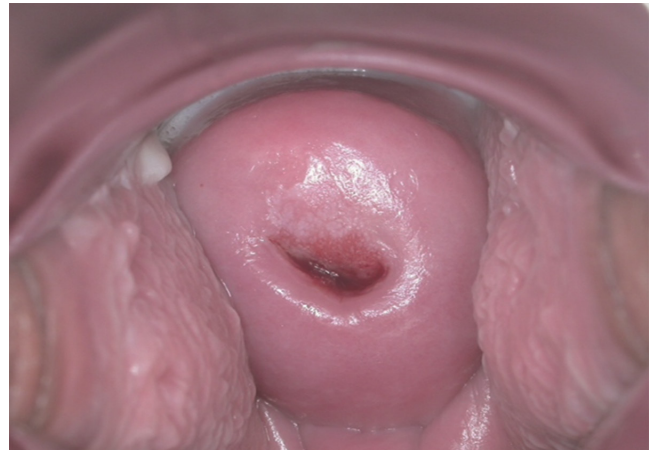
Fig. 4. Thin acetowhite epithelium lesion with fine mosaic vessels comparable with low-grade lesion.

recently published that random biopsies can detect significant diseases in cases with type 16 and 18 infections, even if the disease does not appear on colposcopy [14]. The lesion size of CIN 2 or 3 diagnosed by random biopsy are significantly smaller than lesions diagnosed by colposcopic directed biopsy and involve fewer quadrants of the cervix, associated with old age, low-grade cytology and other than HPV type 16 [9,15]. Similarly, in an Atypical Squamous Cells of Undetermined Significance/Low-Grade Squamous Intraepithelial Lesion Triage Study by Sherman et al. [16], CIN 3 that were missed on initial colposcopy involved very small lesions.