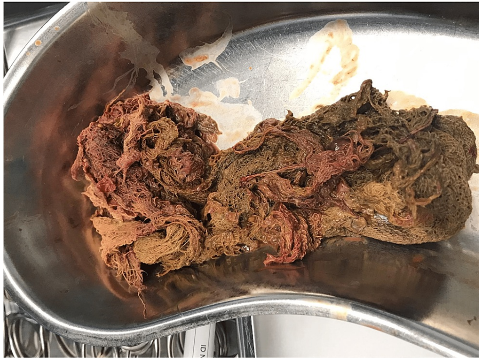
FIGURE 2: Surgical specimen

Postoperative foreign body (gauze) after extraction from the abdominal cavity.