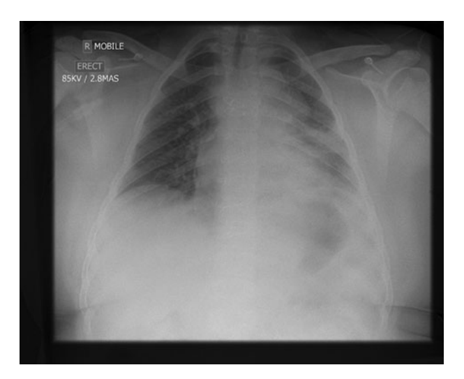
Figure 2. Chest X-ray day 9.

His oxygen requirement increased to a peak of 3 L/min from day 8 to 10 of illness. His chest x-ray, however, on day 9 was unchanged (Fig 2). His full blood count showed haemoglobin 125 g/L, platelets 144 \times 10^9 /L, and total white cell count 2.4 \times 10^9 /L with neutrophils 1.67 \times 10^9 /L and lymphocytes 0.56 \times 10^9 /L. His C-reactive protein was 13. He had a normal renal profile and normal liver profile. Further escalation of ventilatory support was not required, and he remained at ward level care for the duration of his admission. Intravenous antibiotics were stopped after 7 days, and no further medicines were prescribed. He was transferred back to his local hospital on day 14 of his illness self-ventilating in room air prior to his discharge home.