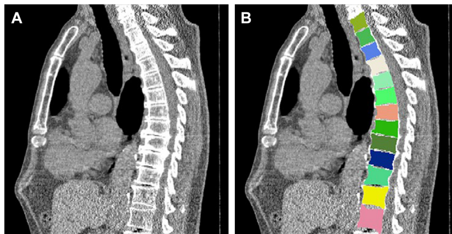
Figure 2 Images of thoracic vertebral bodies for measurement of computed tomography attenuation.

Notes: (A) Sagittal image of thoracic vertebral bodies. (B) Images of identified thoracic vertebral bodies. Each vertebrae was automatically identified and painted using different colors.