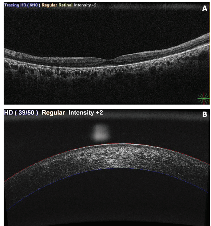
FIGURE 3. (A) Hyperreflective dots in the intraretinal layers and in the retinal pigment epithelium layer are observed in the optic coherence tomography of the left eye. (B) Corneal subepithelial hyperreflective deposits are observed in the anterior segment optic coherence tomography of the right eye.

Our patient had no history of anesthesia or drug use. She and her husband were relative (brother's grandchildren). Her sister's, brother's, and children's OCTs also revealed bilateral corneal subepithelial deposits or hyperreflective dots in the intraretinal layers or in the RPE layer.