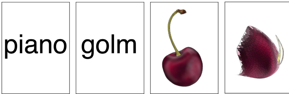
Fig. 1. Examples of visual stimuli. Verbal (words/pseudowords) and nonverbal (pictures of objects and non-objects) visual stimuli.