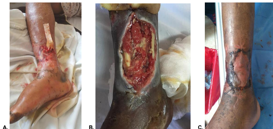
Image 1. Progressive treatment of extensive myonecrosis in snakebite victim. A. 10 days after bite with drain insert into abscess. B. Two weeks after bite and extensive debridement. C. Status post graft hospital day 50.

Our patient was geographically isolated and spent days receiving shamanistic care. These are common barriers for those living in remote rainforest communities that prevent prompt definitive care of snakebites. Approximately half of those bitten in Latin American countries will be treated first