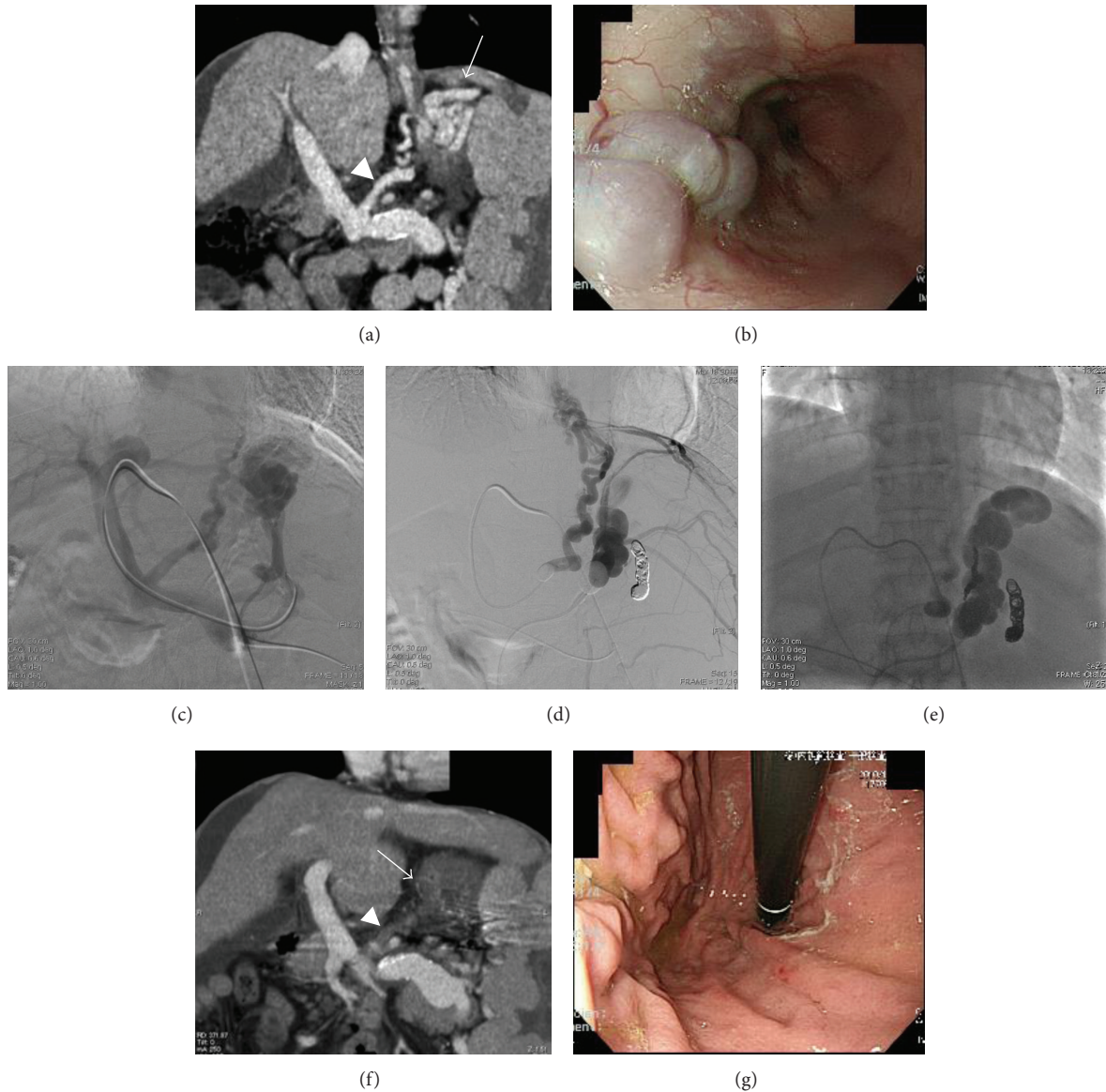
FIGURE 2: A 36-year-old woman with gastroesophageal varices. The patient visited our outpatient clinic because of general fatigue. Hematologic tests showed liver dysfunction and pancytopenia, and the gastroesophageal varices tended to worsen despite several sessions of endoscopic therapy. An enhanced computed tomography (CT) scan coronal image (a) showed dilated and tortuous veins at the gastric fundus (arrow), and large gastric varices supplied by the left gastric vein (arrowhead). Endoscopic examination of the stomach (b) showed significant large tumorous gastroesophageal varices (F3). Such varices pose a high risk of variceal bleeding and are an indication for embolotherapy. This patient underwent combined balloon-occluded retrograde transvenous obliteration (BRTO) and PTO therapy. Direct portography (c) showed gastroesophageal varices from the left gastric vein and posterior gastric vein. Balloon-occluded left gastric venography and left adrenal venography after embolization of the posterior gastric vein with platinum coils showed the left inferior phrenic vein and intercostal vein as collateral vessels (d). Fluoroscopic image obtained at 4 hours after embolotherapy shows the varices filled with iopamidol (e). An enhanced coronal CT scan obtained 14 days after embolotherapy showing the gastric varices and the left gastric vein as a low-density area ((f), arrow and arrowhead), suggesting complete obliteration. Endoscopic examination conducted 6 months after the embolotherapy showed eradication of the gastroesophageal varices (g).

the severity of the submucosal varices was significantly reduced in 6 patients (2 underwent PTO and 4 underwent combined PTO and BRTO). Additionally, 2 of these 6 patients received subsequent endoscopic injection sclerotherapy (EIS) for small, residual esophageal varices. Endoscopic findings showed F0 in 7 patients, F1 in 5 patients, and F2 in 1 patient, with complete absence of red spots.