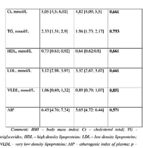
level of statistical significance of difference

Waist circumference, body weight and BMI in subgroup with normal hopelessness range in the group of patients with MetS were significantly higher (figure 1).