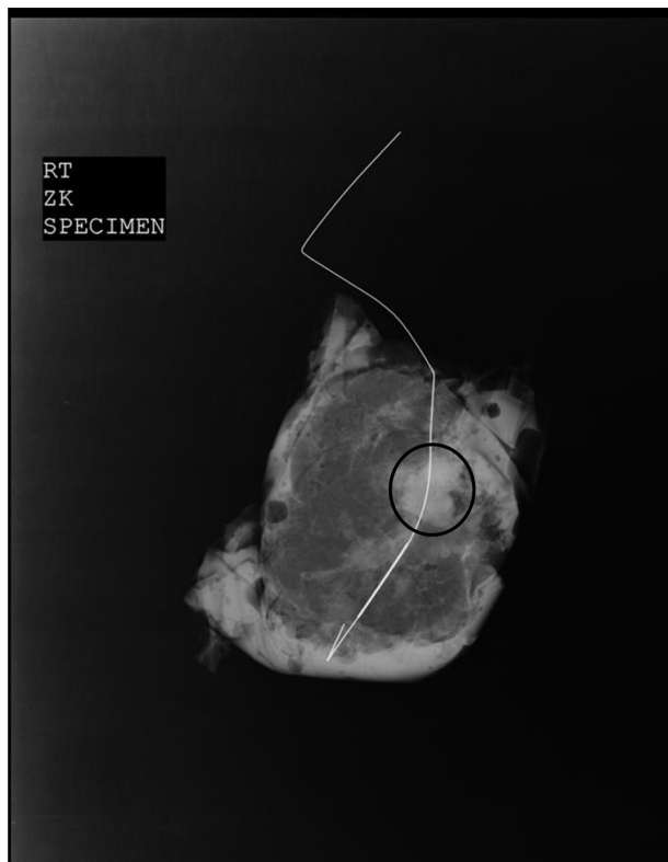
Figure 2 Magnified view of excised breast specimen showing the localized soft tissue density nodule (Black Circle) with Kopan's wire in situ.