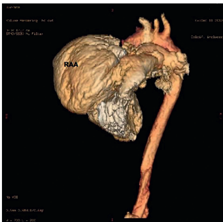
FIGURE 3: Right atrial aneurysm by three-dimensional CT angiography. RAA: right atrial aneurysm.

The large aperture of the aneurysm was connected to the right atrium. It was mildly compressing the right ventricle and tricuspid valve (Figure 1). 3-dimensional CT angiography confirmed the giant aneurysm connected to the right atrium, measuring 4.2 \times 2.3 cm in size (Figures 2 and 3). Meanwhile, results of blood analysis for the jaundice were as follows: total bilirubin, 17.1 mg/dl; direct bilirubin, 13.9 mg/dl; alanine aminotransferase, 120 IU/L; aspartate aminotransferase, 82 IU/L; and gamma glutamyl transferase, 20 IU/L. Abdominal ultrasonography yielded normal results except for hepatomegaly. Magnetic resonance cholangiography findings were also normal. There were no butterfly vertebrae on chest radiographs or facial features suggestive of Alagille syndrome. Results of vision and hearing examinations with brainstem-auditory evoked responses were also unremarkable. Tests showed normal renal function and normal blood sugar. Histological examination of liver biopsy specimens suggested progressive familial intrahepatic cholestasis type 3. The patient was started on ursodeoxycholic acid and kept under close observation.